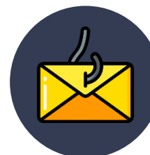
Phishing Email Quiz