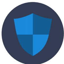
GDPR: The Basics