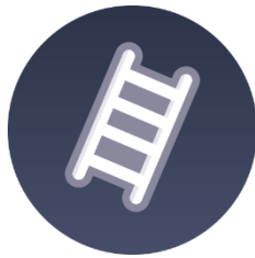
Working at Height