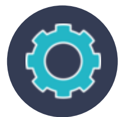
Abrasive Wheel Training