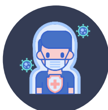
Infection Prevention & Control