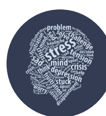
Mental Health Awareness