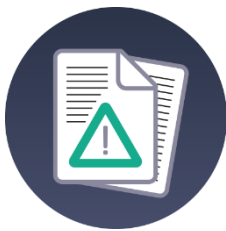
Awareness of Health & Safety at Work