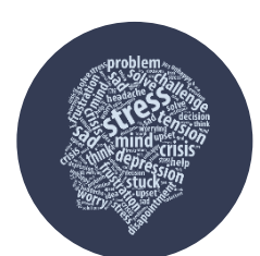
Mental Health Awareness: For Managers