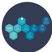
Data Protection Principles