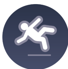
Slips, Trips & Falls