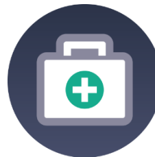
First Aid: Primary Survey